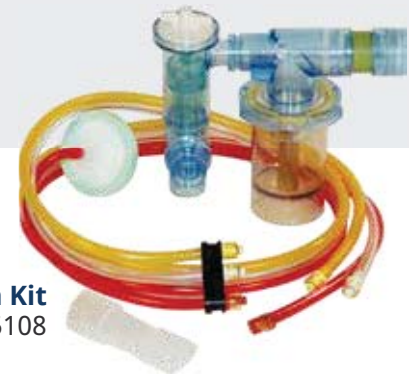
Phasitron Kit A55108